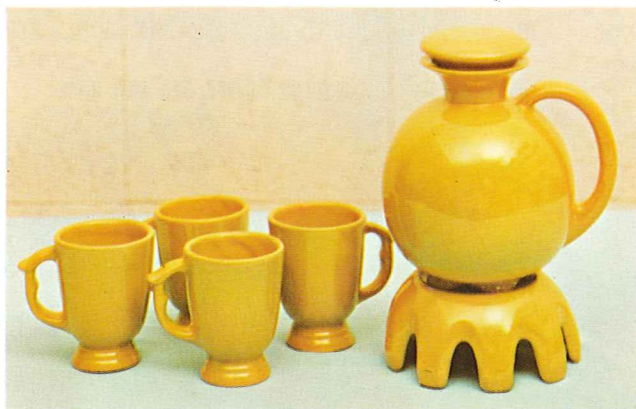
C12— 7 OZ. MUG—2.00 EACH 82—6-CUP CARAFE & LID—8.00 82W—WARMER—4.00 82 SET—12.00