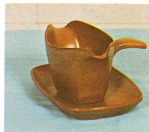
6S—TWO-SPOUT GRAVY—4.00 5PS—9" PLATTER-TRAY—2.50 6S/ST—TWO-SPOUT GRAVY/W TRAY—6.50