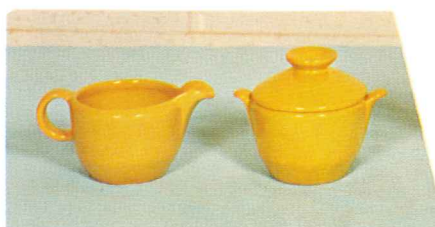
6A—9 OZ. CREAMER—2.00 6B—SUGAR WITH LID—3.00 6AB—CREAMER & SUGAR SET—5.00