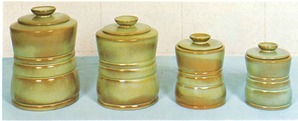
26F—FLOUR, COOKIES CORN MEAL—10.50