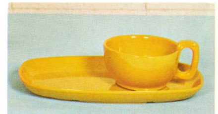
4SC—11 OZ. SOUP CUP—3.00 6P—11" PLATTER-TRAY—3.00