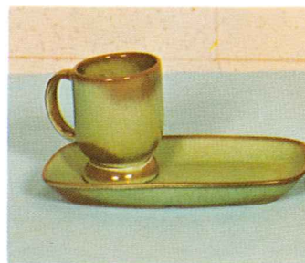
G2—10 OZ. MUG—2.00 5PS—9" PLATTER-TRAY—2.50