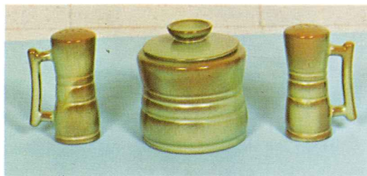
26G—SUGAR/GREASE—6.00 26H—SALT & PEPPER—4.00 PAIR 4-PIECE SET/BOXED—10.00