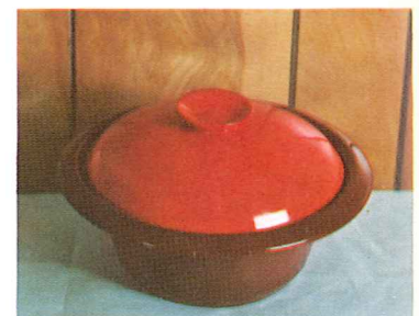
6VS—1½ QT. BAKER—6.00 (FOR FLAME AS SHOWN ADD 50% TO ABOVE PRICE)